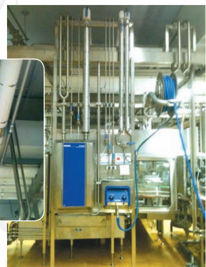
ABOVE: Filler clean & hygiene point.